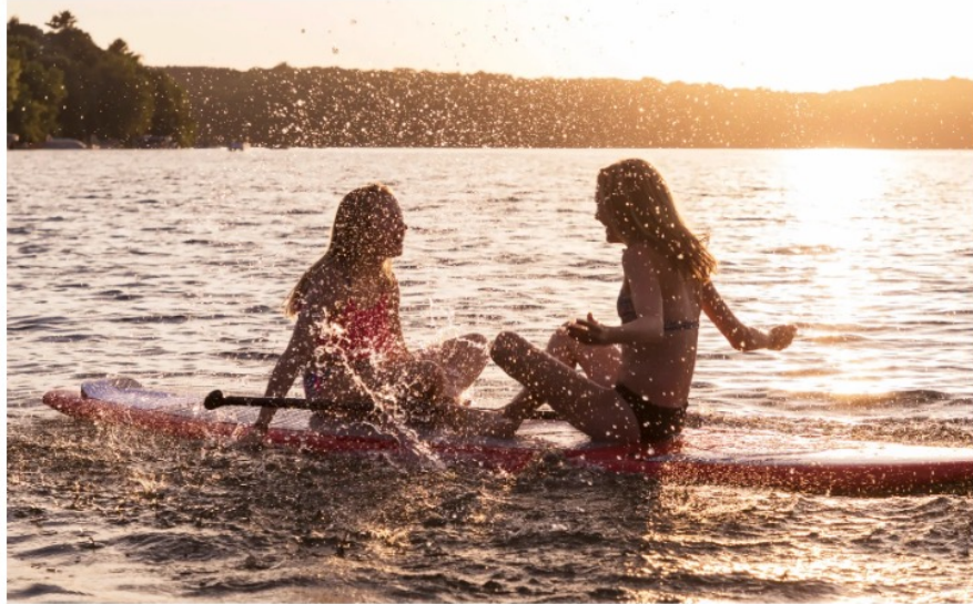
Stillwater, Minnesota sits on the shores of the St. Croix River and has its own aerial lift bridge and riverfront park.

Where to stay: While the island's grand dame hotel, the aptly named Grand Hotel , reigns supreme, plenty of other lodging options like Mission Point or the Island House exist.